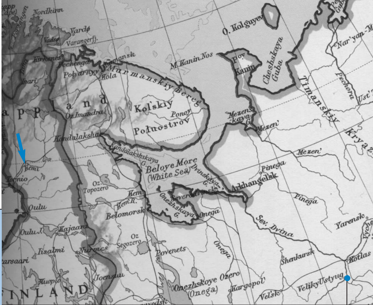
ABOVE: pinpointing your benefactors: Santa Claus resides with his elves at Rovaniemi in Lapland and Father Frost and the Snow Maiden live at Veliky Ustyug ( scale 1:8,000,000); RIGHT: spring view of Veliky Ustyug across the frozen Sukhona river