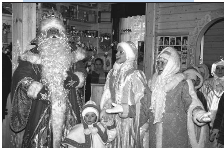
Father Frost (Ded Moroz) and accessories in Veliky Ustyug

There are hints of the past throughout Veliky Ustyug. In one square there is a monument to Dezhnev (Дежнев), the seventeenth century explorer born here. He was the first European to discover the Bering Strait between Asia and Alaska. This is a fine historical detail that goes unremarked in the modern town on the Sukhona river by the men with their vodka bottles who gather each day at the Dezhnev monument. And though the merchants have long gone, the Severnaia Chern workshop on Uspenskaia perpetuates a remnant of the town's former exotic trading connections. There, patient craftsmen still produce fine niello silverwork of a kind not seen anywhere else in northern Europe — delicate black alloy inlaid on engraved silver in a style more commonly associated with Egypt, Thailand or the hill villages of Dagestan. But the high waters of 1998 brought in another kind of trade. Father Frost set up for business in Veliky Ustyug, bringing unprecedented trade to the town's handsome white post office, its one hotel